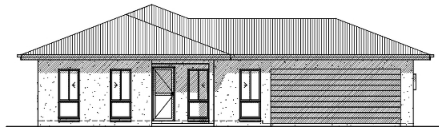
Standard Front Elevation