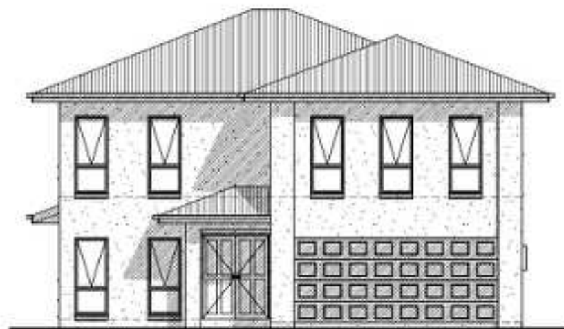
Standard Front Elevation