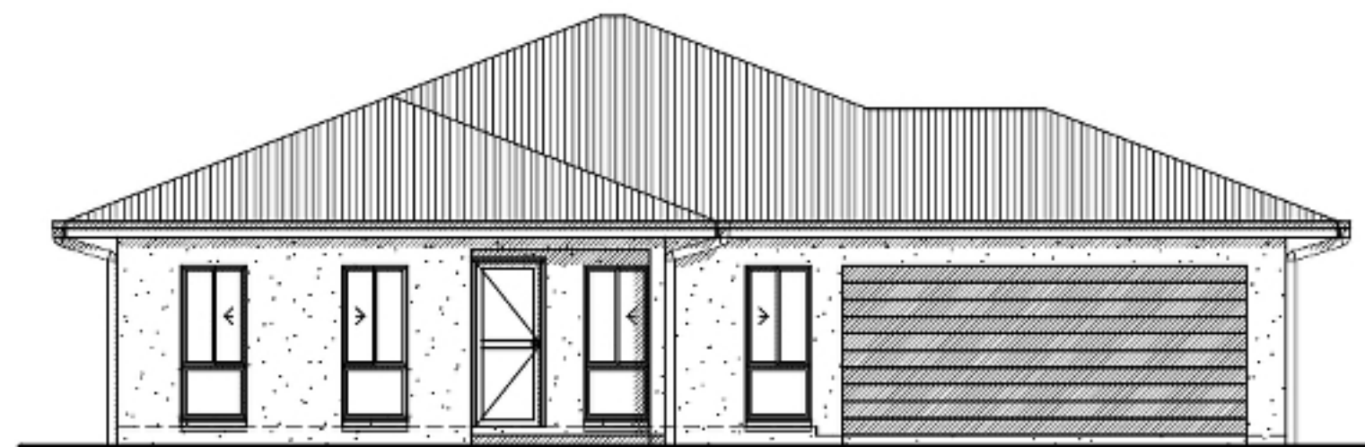
Standard Front Elevation